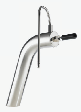
Round Manual Above Steamer