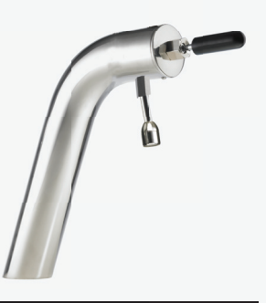
Round Manual Hot Water