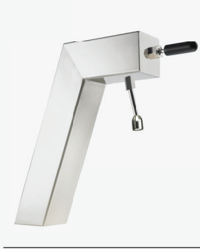
Square Manual Hot Water