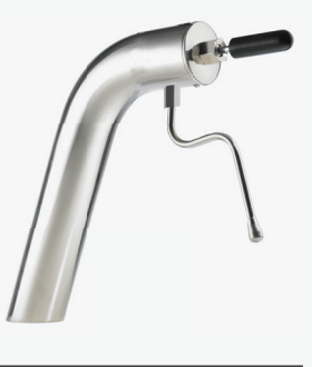
Round Manual Below Steamer

The Viper Steamer offers different finishes and power coat colours for the cafes that want to stand out. Ask in store about the many different colours and finishes available.