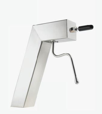
Square Manual Below Steamer

We offer a range of custom options to suit your needs. Our units can be selected with one of the following: A Traditional styled steam wand mounted from below, a modern styled steam wand, able to rotate 360 degrees for a left or right hand operation. A specialised nozzle for dedicated Hot Water or a PID Controlled Steamer for automatic steam temperature cutoff and frothing.