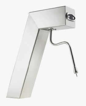
PID Controlled Auto Steamer