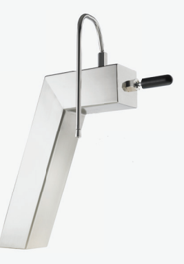
Square Manual Above Steamer