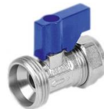
15mm to ¾ inch male BSP service valve

Brita Purity 1200 - 288mm x 288mm x 545mm (H)